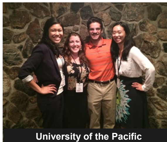
University of the Pacific