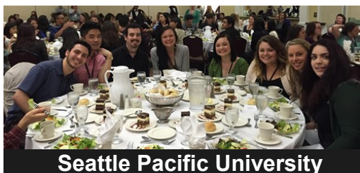
Seattle Pacific University