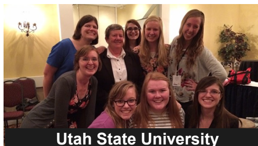
Utah State University