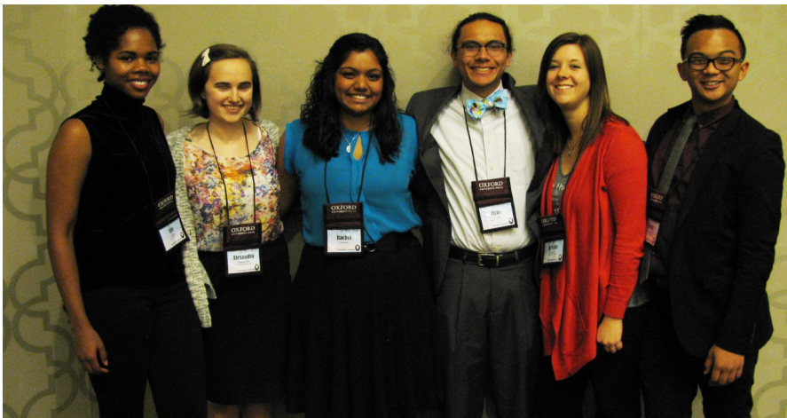
2015 AMTAS Executive Board