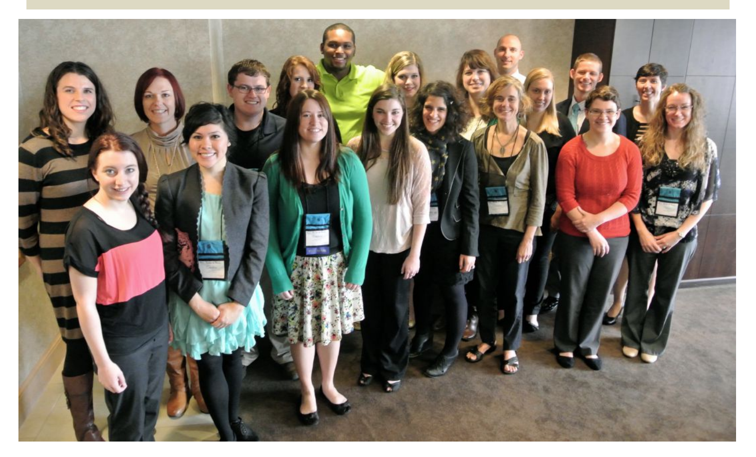
SAAB Members at SAAB Meeting 2013, Jacksonville Florida