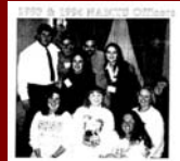
Photo taken from the 1993 fall newsletter