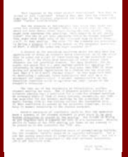
An editorial written in the 1974 student newsletter stating the need for a national organization.