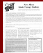
Newsletter announcing the new student scholarship.