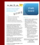
The current scholarships AMTAS is able to award after years of growth and hard work.