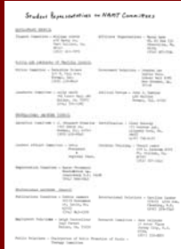
Agenda from the 1994 SAAB Meetings